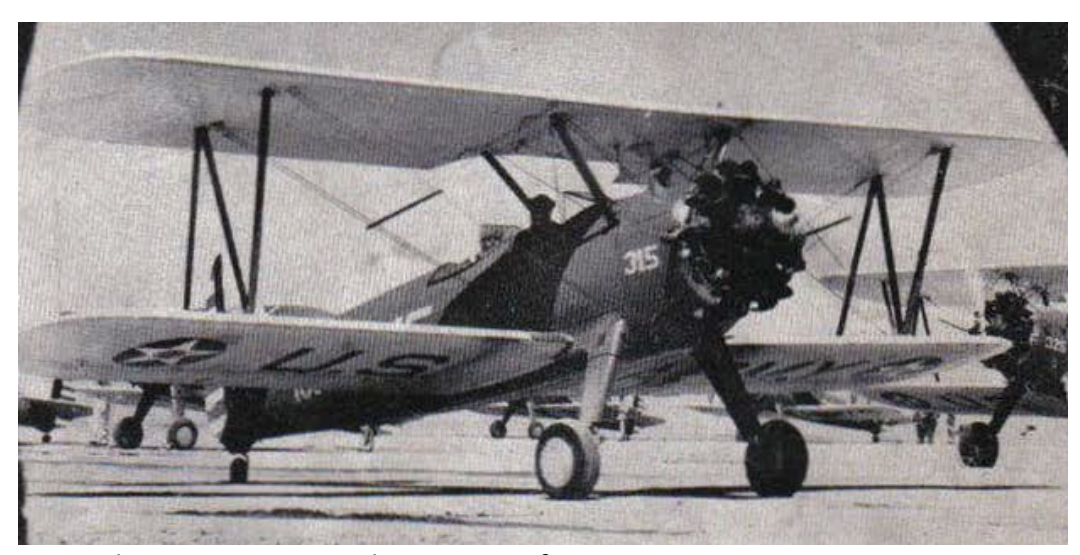
4 AAF Flying Training Detachment aircraft