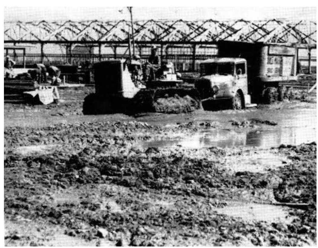
Rankin Field during construction.